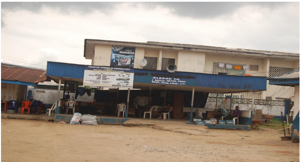
Plate 1 &2: showing empty parks: Peace Mass Transport Company and Transport Company of Anambra State (TRACAS), Etta Agbor Road, Calabar, during Covid-19 lockdown.

The Cross River State scenario bordering intrastate transportation or movement was however different as commuters were exempted from total lockdown as was experienced by most states in Nigeria, but with little restrictions such as reduction in the number of passengers to be on board, reduction in the daily hours of operation. This research is therefore conceived within the peak of COVID-19, to investigate the impact of COVID-19 measures put in place in the state on the transporters in the state.